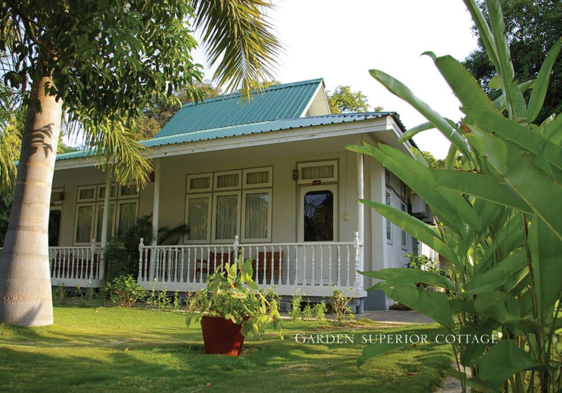
GARDEN SUPERIOR COTTAGE