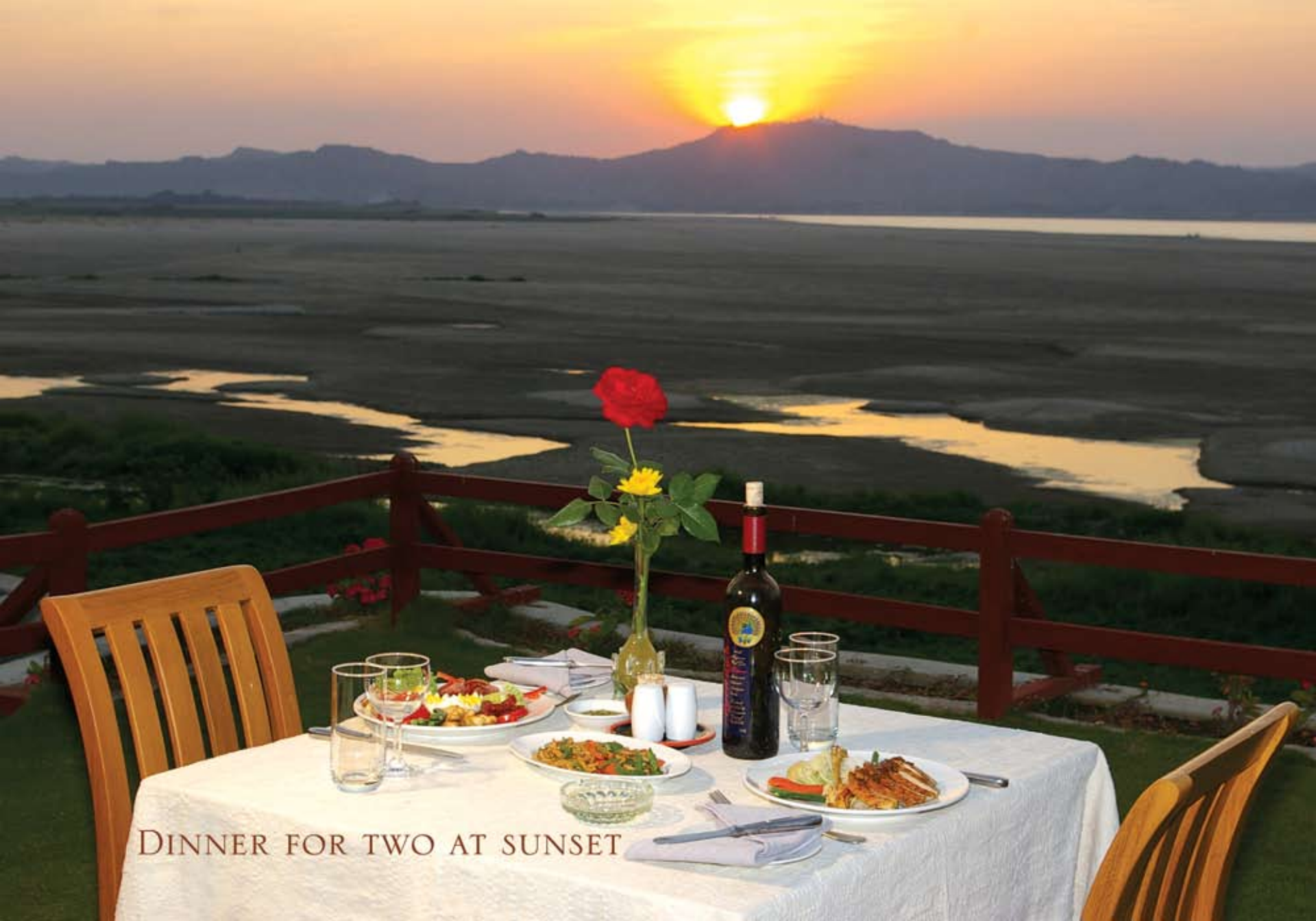
DINNER FOR TWO AT SUNSET